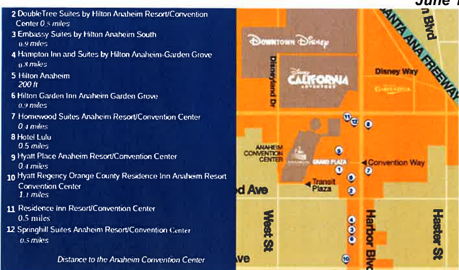
Click to see larger map

June 16, 2022 E911 Special Committee Meeting